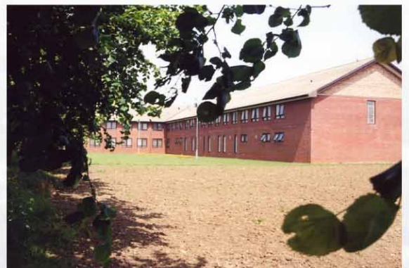
ENTRY BUILDING AND VISITS