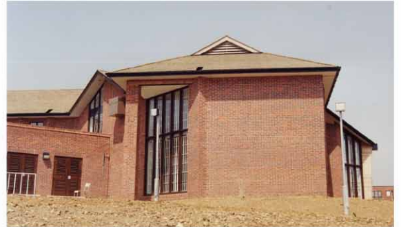
SCREEN WINDOW TO DAYROOM

Guys Marsh was one of a group of four establishments that were effectively re-built over the period.